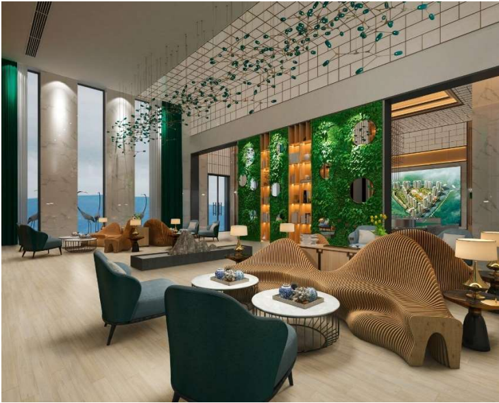
Taralay Impression Hop Compact